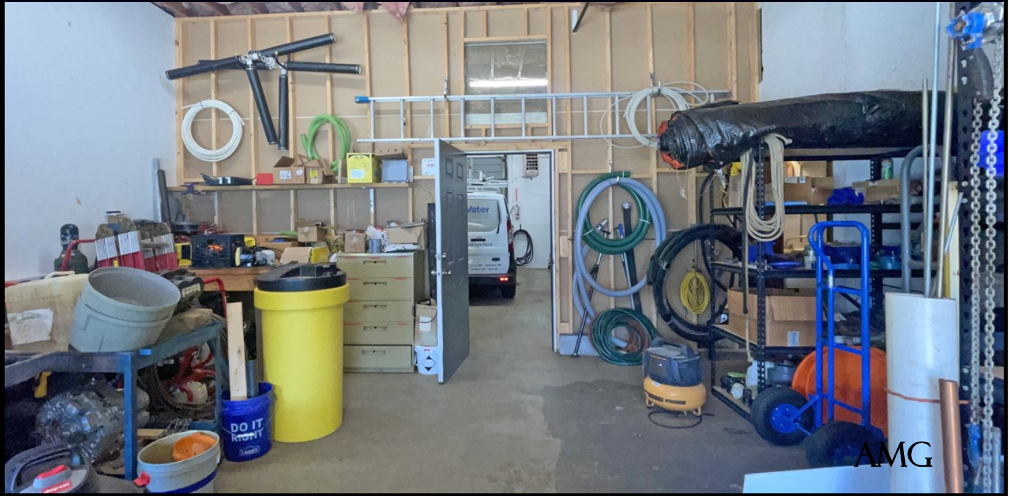
Unit 20 Bay looking into unit 20 bay with 11' ceiling height