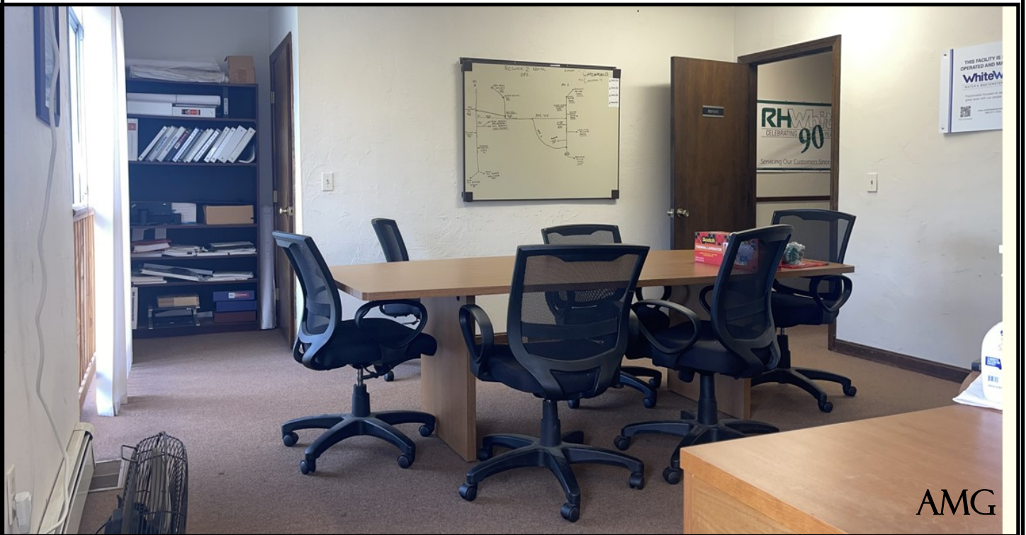
Unit 7 second Floor office, 15' x 9' kitchen and private bath