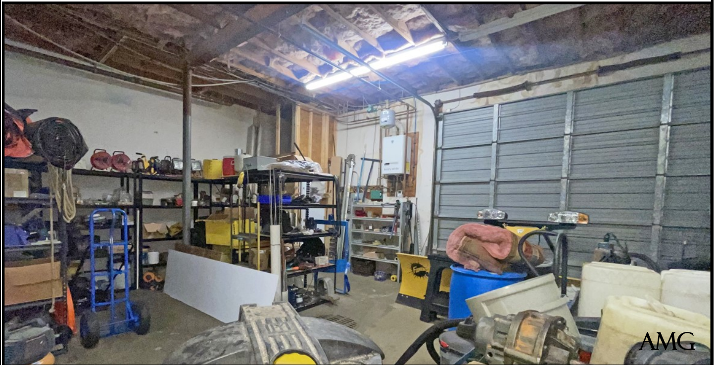
Unit 20—24' x 24' bay, 13' x 10' overhead door and private bath