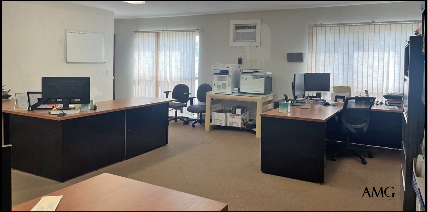
Unit 20 second Floor office and private bath