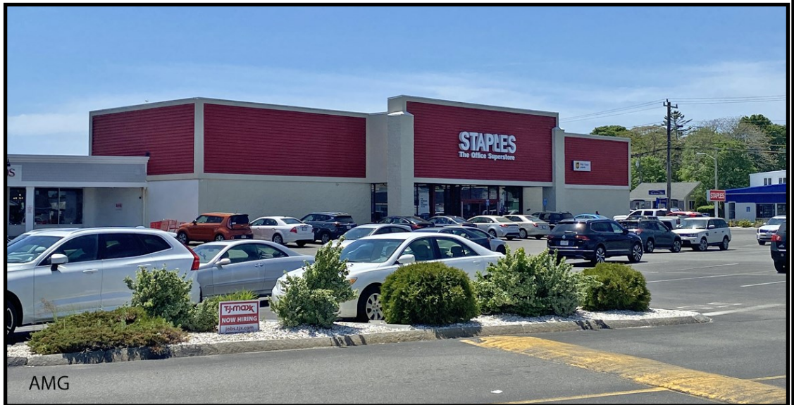
Right - Directly across the parking lot from Staples