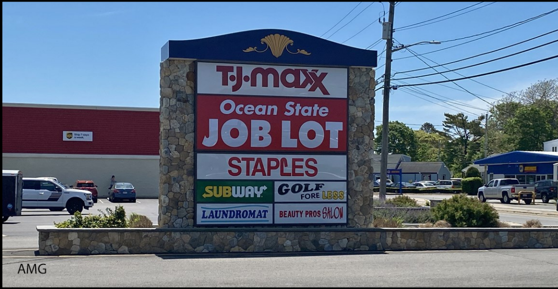
Left - Curb cuts and plaza signage on Barnstable Road and Route 28 (Iyannough Road)