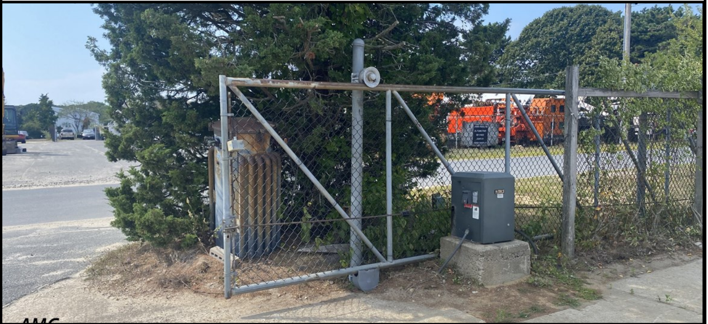
Top –front of the building. Bottom– gate at entrance to lot.