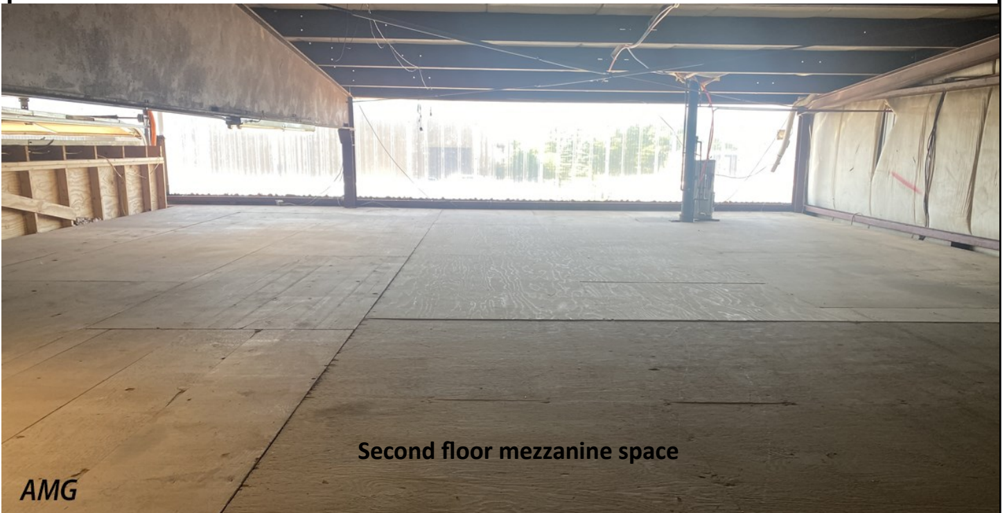
Second floor mezzanine space