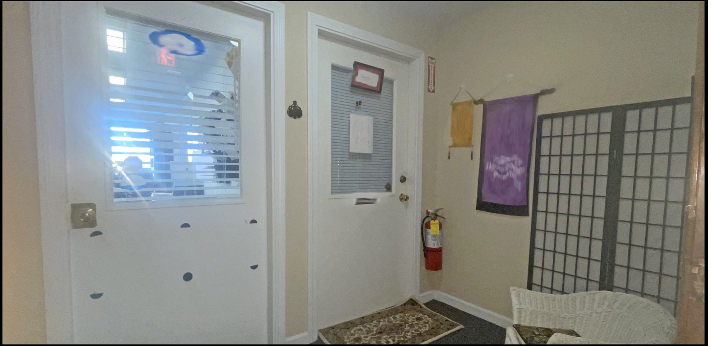
Above – Private entry to private offices