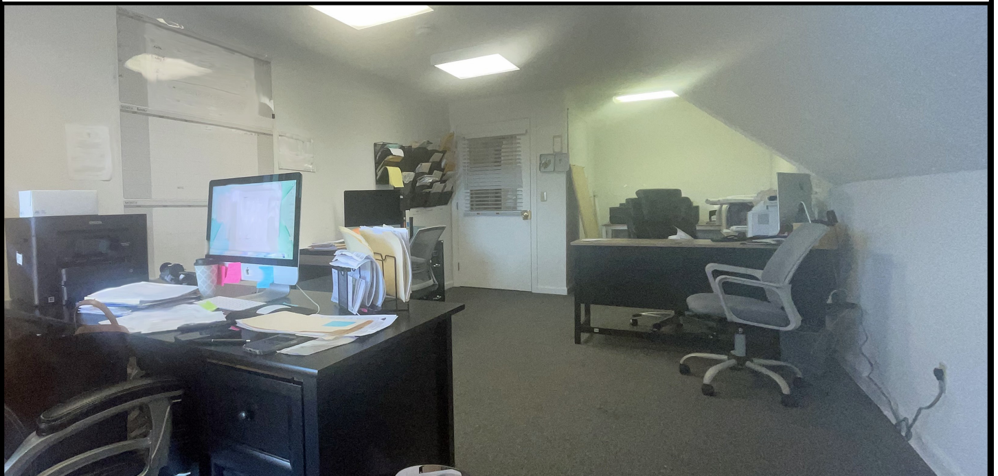
Above– Looking toward office entrance