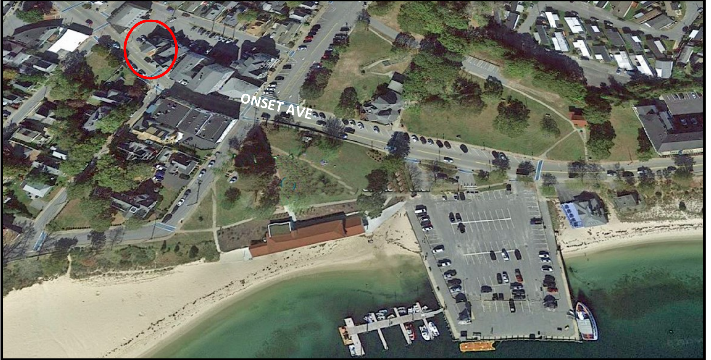
Above- Property is in Onset Village, within walking distance to the pier & gazebo.