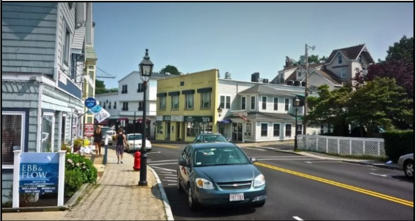
Above- Downtown Onset and 211 Onset Ave, left.