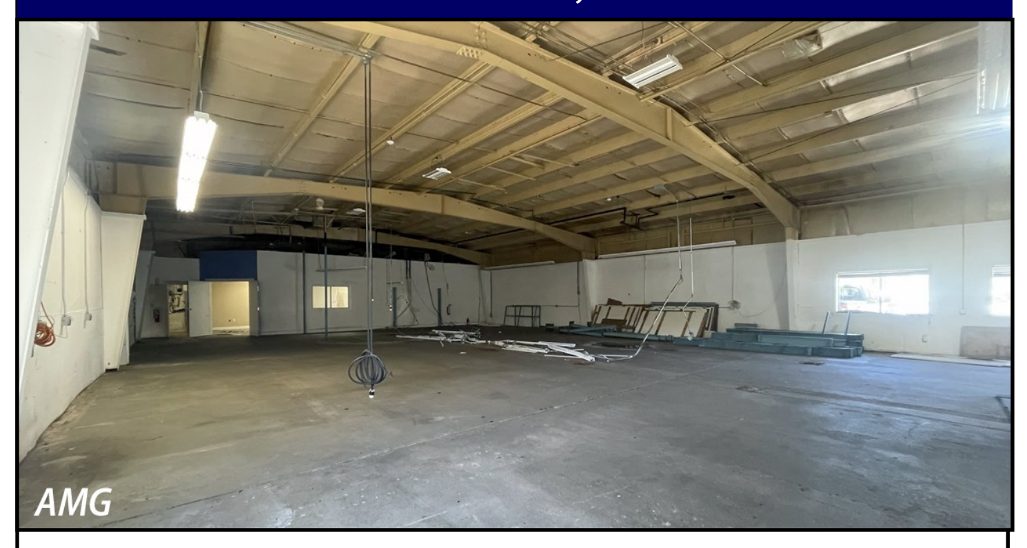
Open warehouse space in the center. Offices and work areas may be reconfigured.