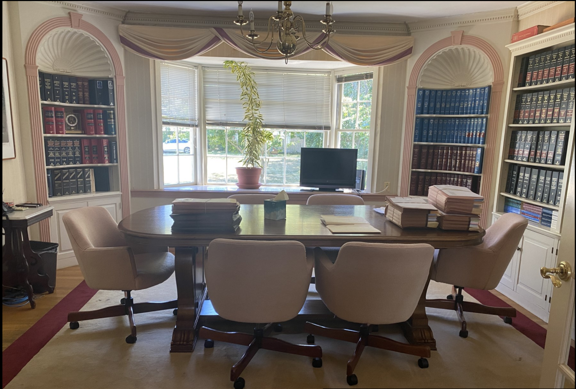
Above- First floor conference room.