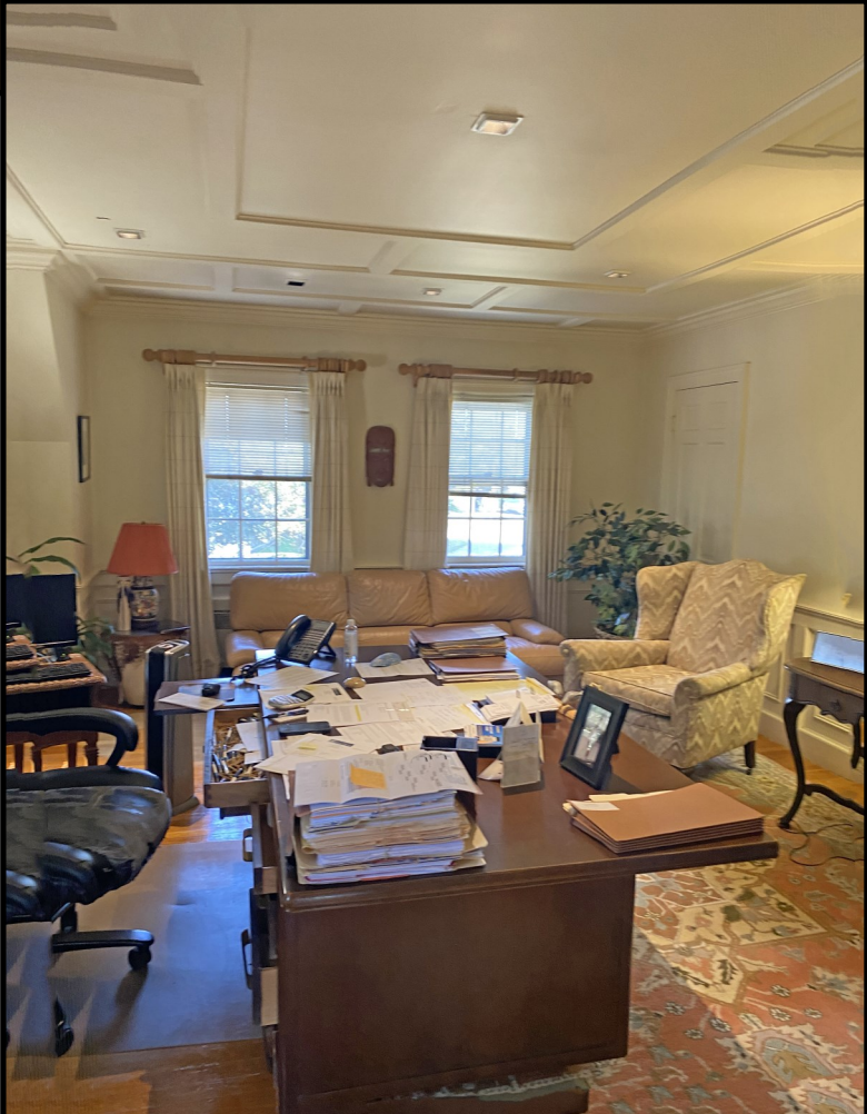
Below- Second floor Executive office