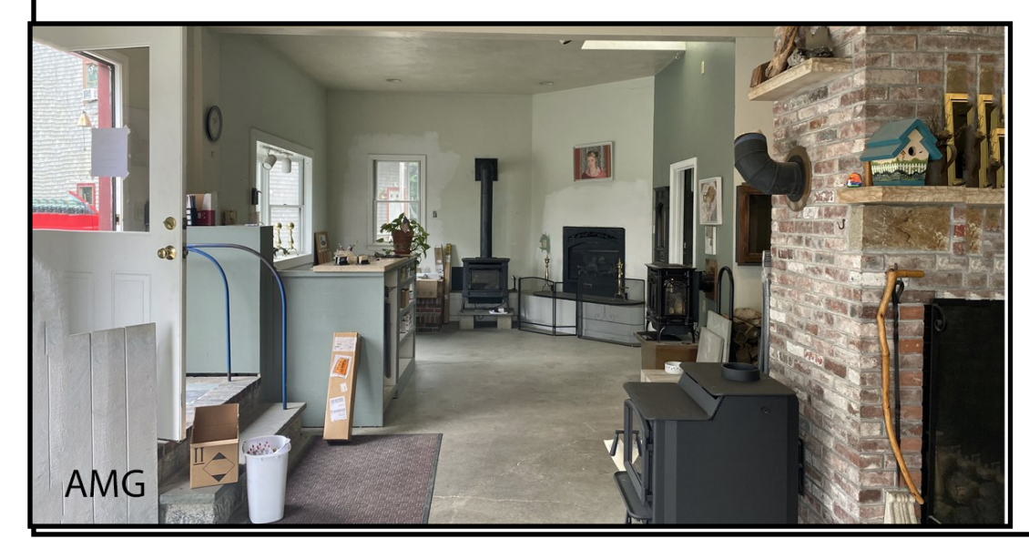
Left Front showroom has center fireplace and a bay door in the front.