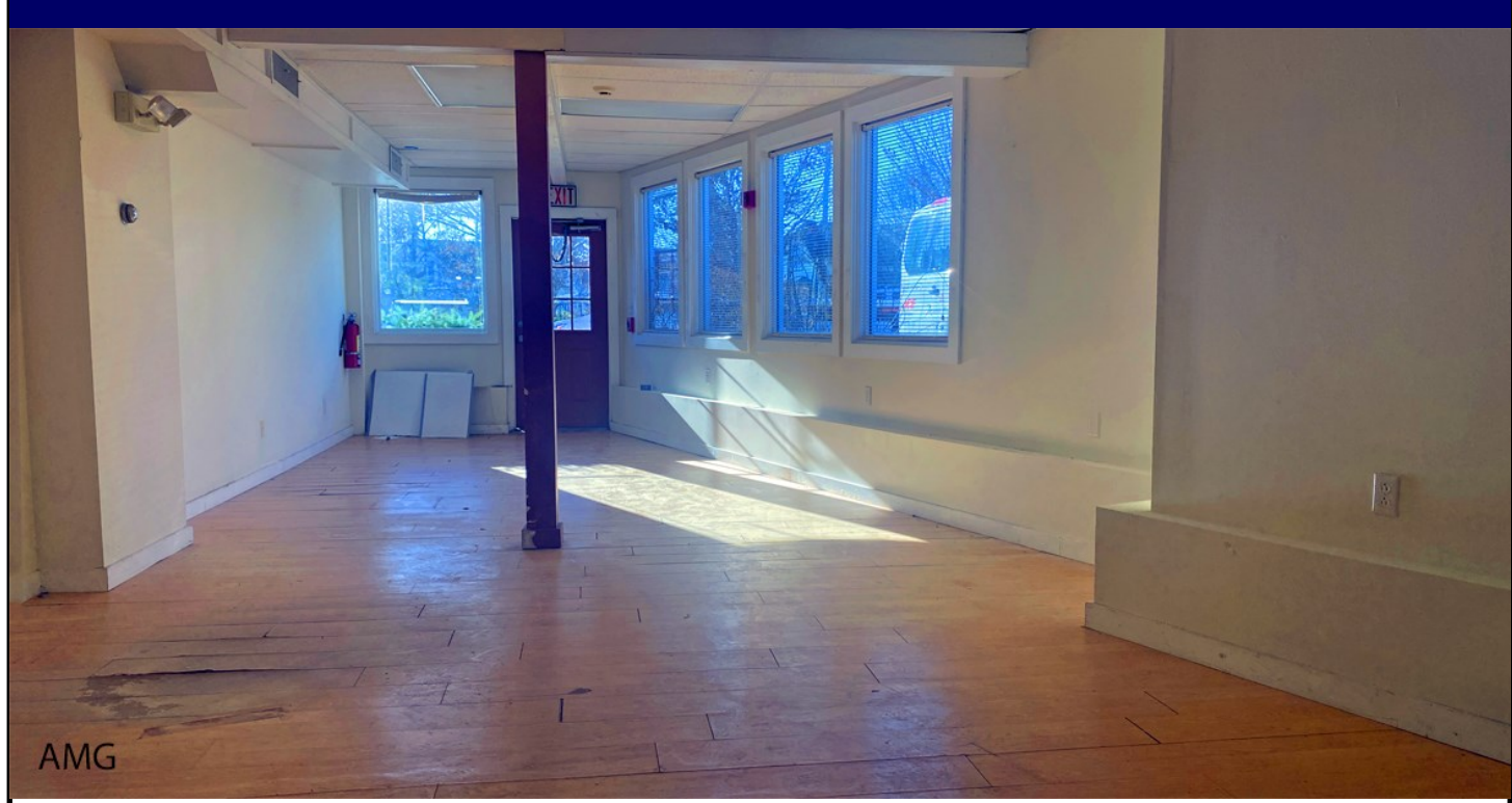
Storefront with lots of natural light.