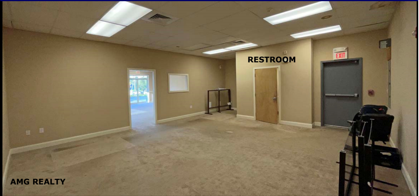
Above- Back room measuring approximately 23' x 21' looking towards opening to the front.