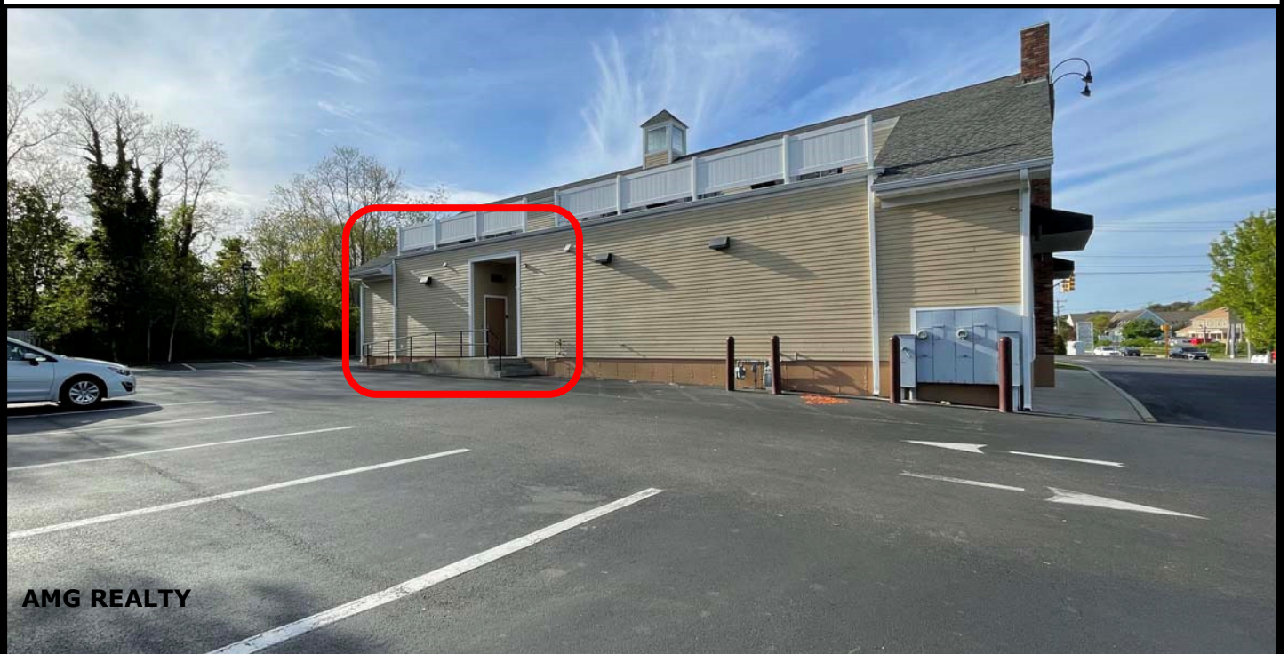
Above- Back of the building showing the rear egress and ramp. Ample parking and second curb cut onto Swan River Rd.