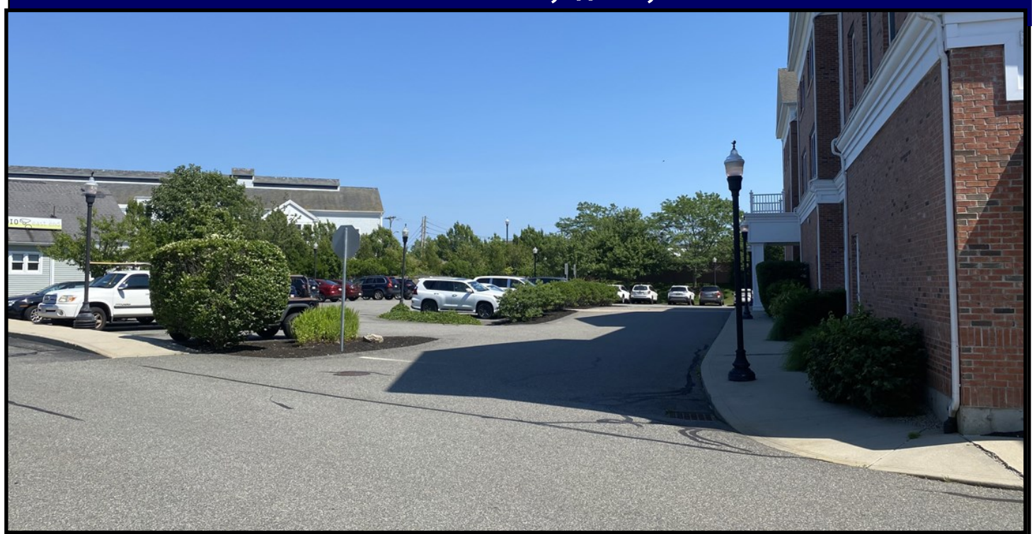
Above –Lots of parking in the rear. The 2nd and 3rd floors are all high end residential condos.