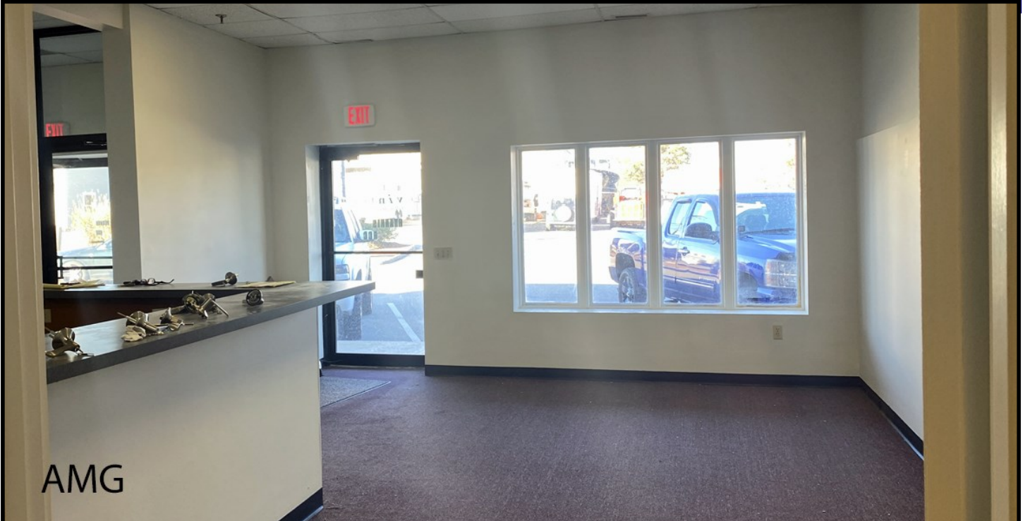
Above and below– Looking towards the front windows and the reception area.