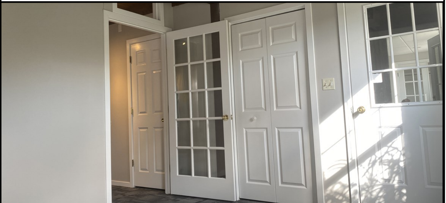
Above- Standing in the front office. To the right, straight ahead, is the door to the front foyer. Middle is the closet door. Left, the glass panel door, goes to the wide open room and the two bathrooms.