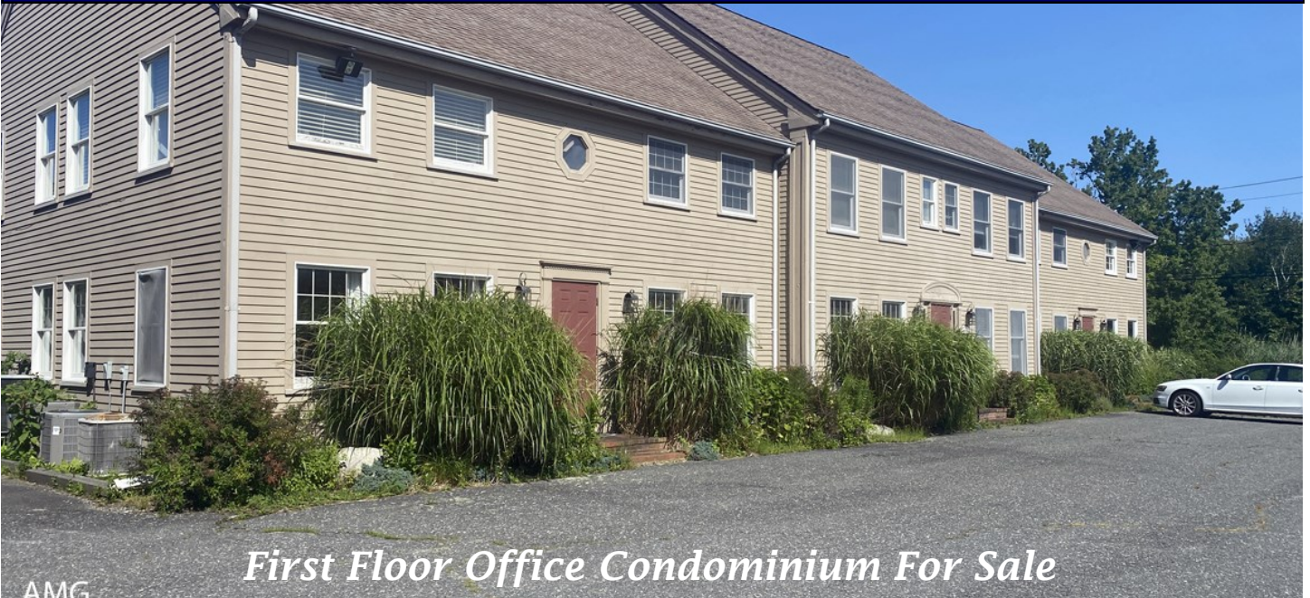
First Floor Office Condominium For Sale