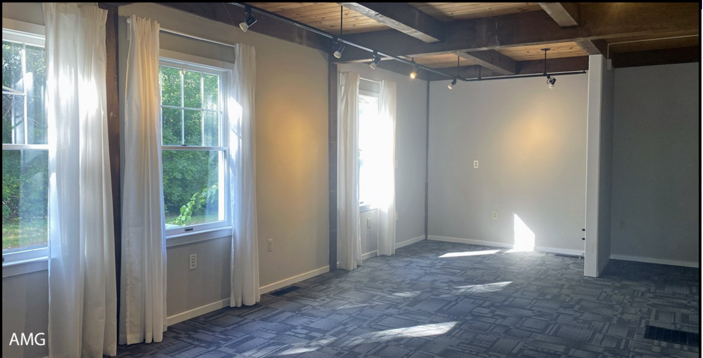
Above– Large, open room with three windows along one side, and two in front.