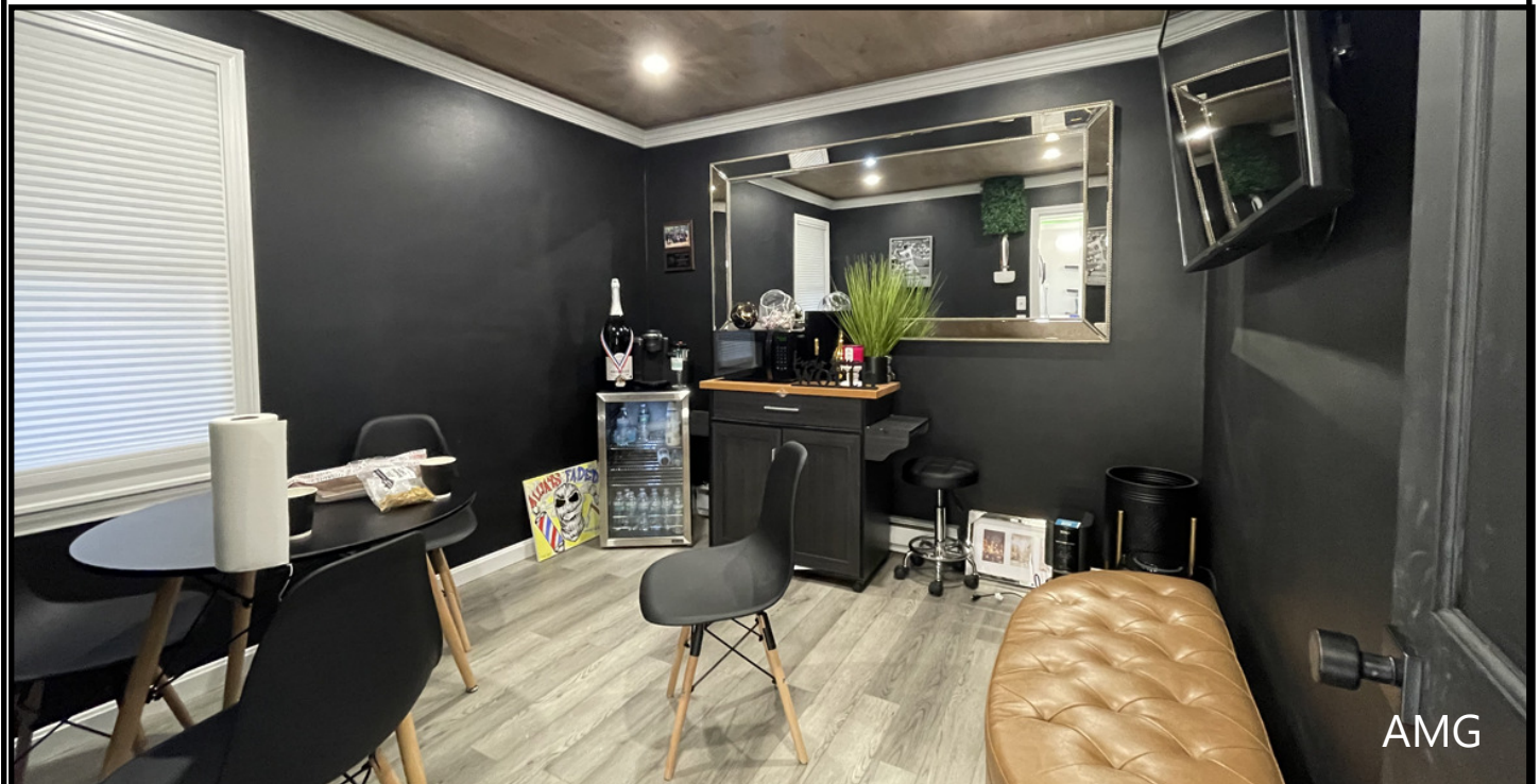
Above- Open room for waiting area, treatment or professional office use.