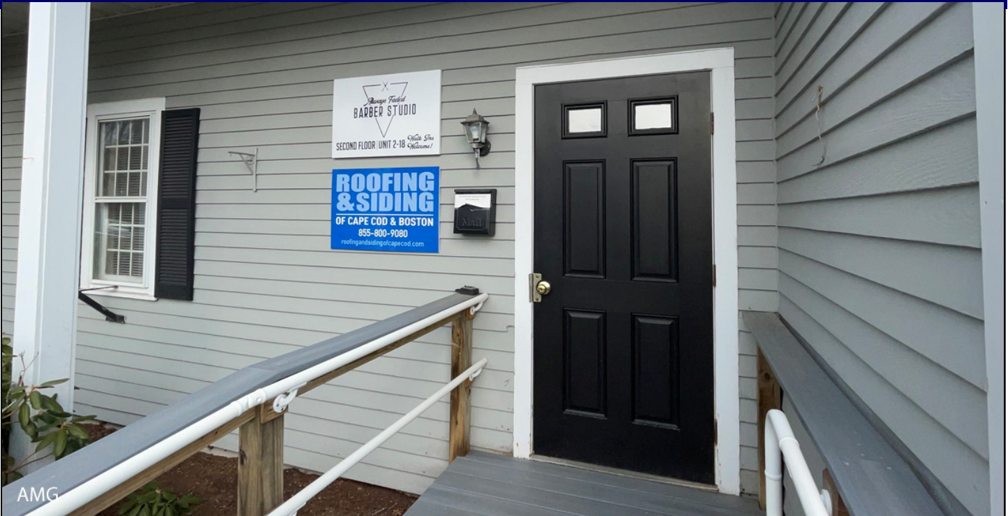
Above –Entrance to the building