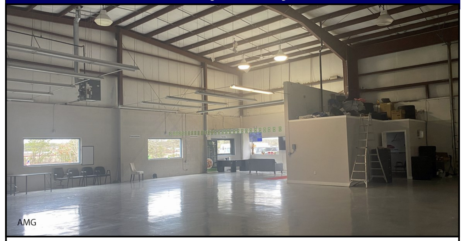
Above –Wide open bay space with overhead lighting and two gas fired heaters and clean, epoxy floors.