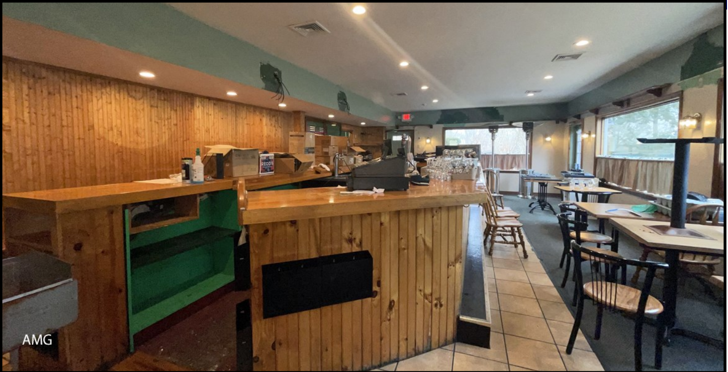
Above— Dining room with lots of natural light and also ceiling lighting. Current layout features a bar that can stay or go.