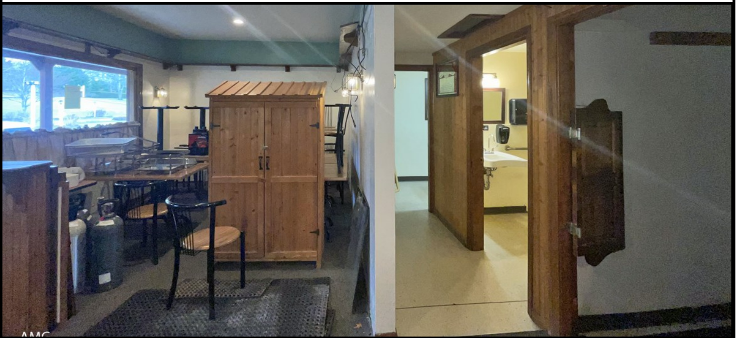
Above- Showing space just to the left of the entryway, and the hallway to the bathroom.