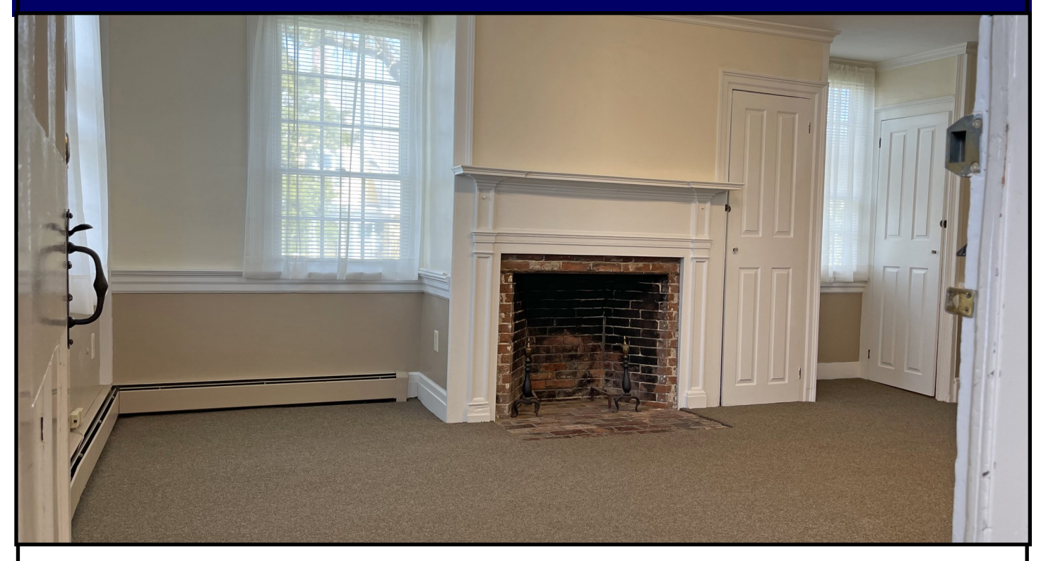
250 sq. ft. corner office with fireplace and 3 windows, 2 closets, fresh paint and new carpet