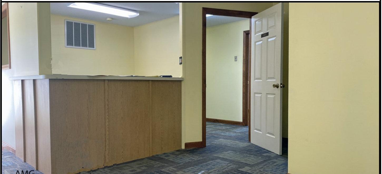
Above— Center hallway with reception/ waiting on the left