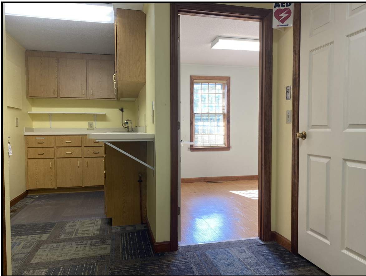
Two storage rooms AMG

Above– looking into a front office (right) and the sterilization room (left), which would make an ideal kitchen.