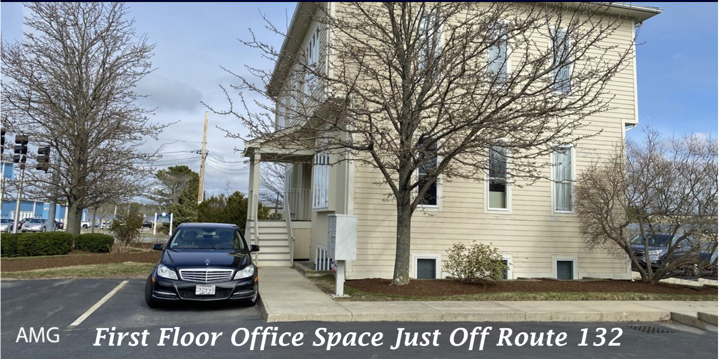
AMG First Floor Office Space Just Off Route 132

FOR LEASE: 129 AIRPORT ROAD, U-3. HYANNIS