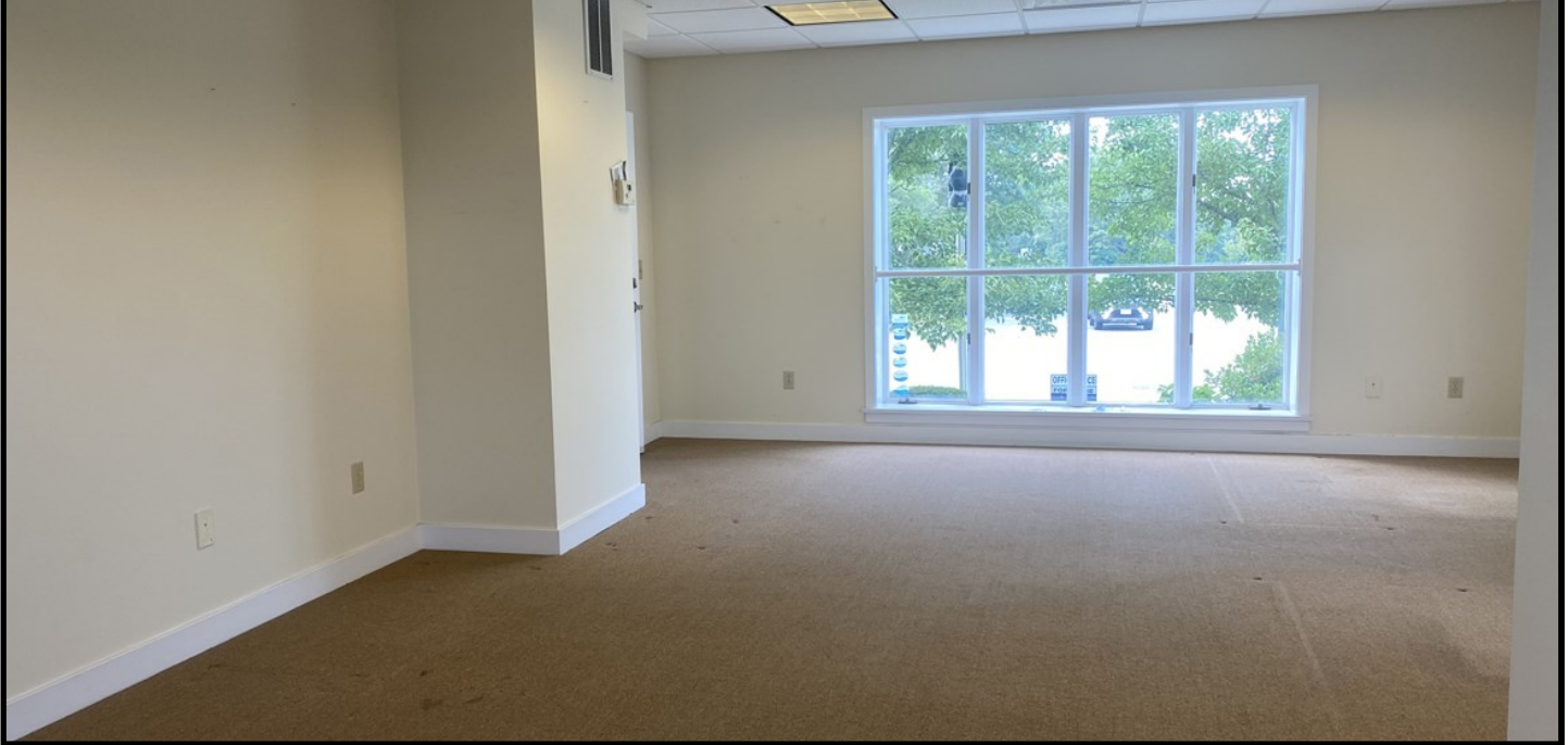
Above— tall windows all around. Enter from the common foyer. Carpets shown have been replaced.