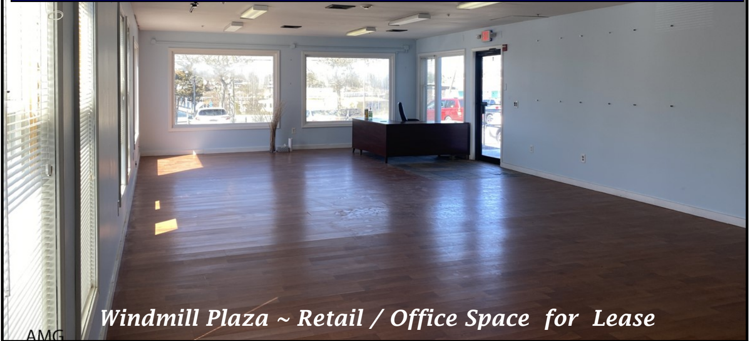
Windmill Plaza ~ Retail / Office Space for Lease