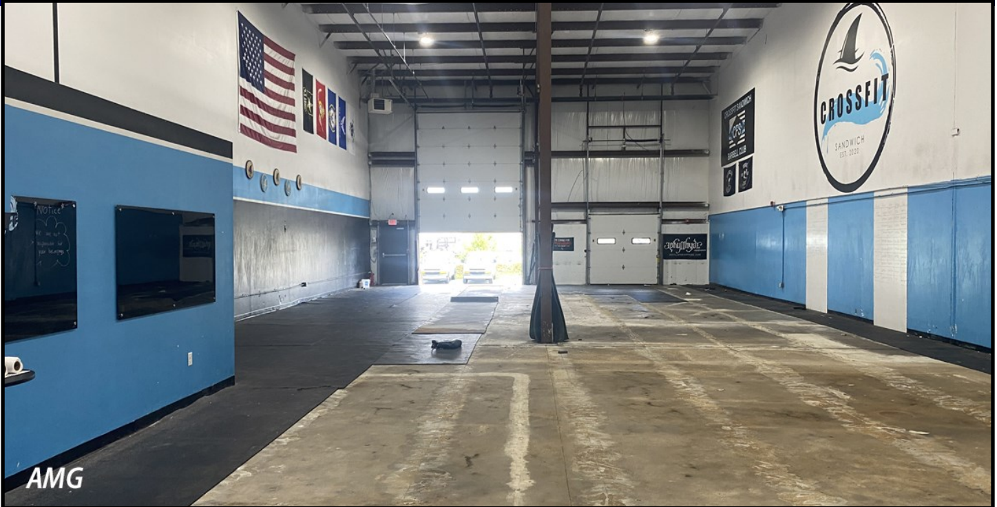
Above- Looking towards the overhead doors with loading docks. Bathrooms are on left.