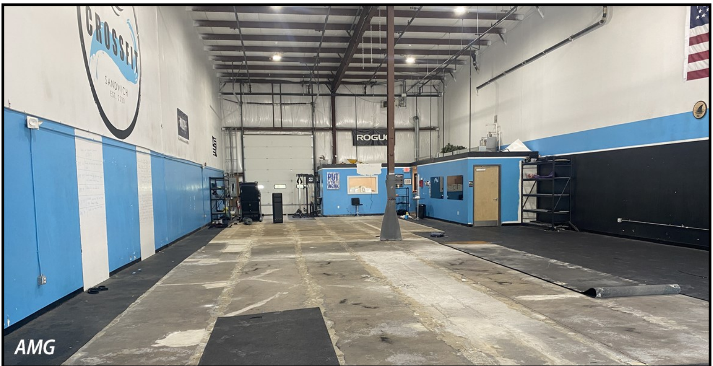
Above –Looking to entrance, reception and the two ADA compliant bathrooms. Ceiling height is 25'+.