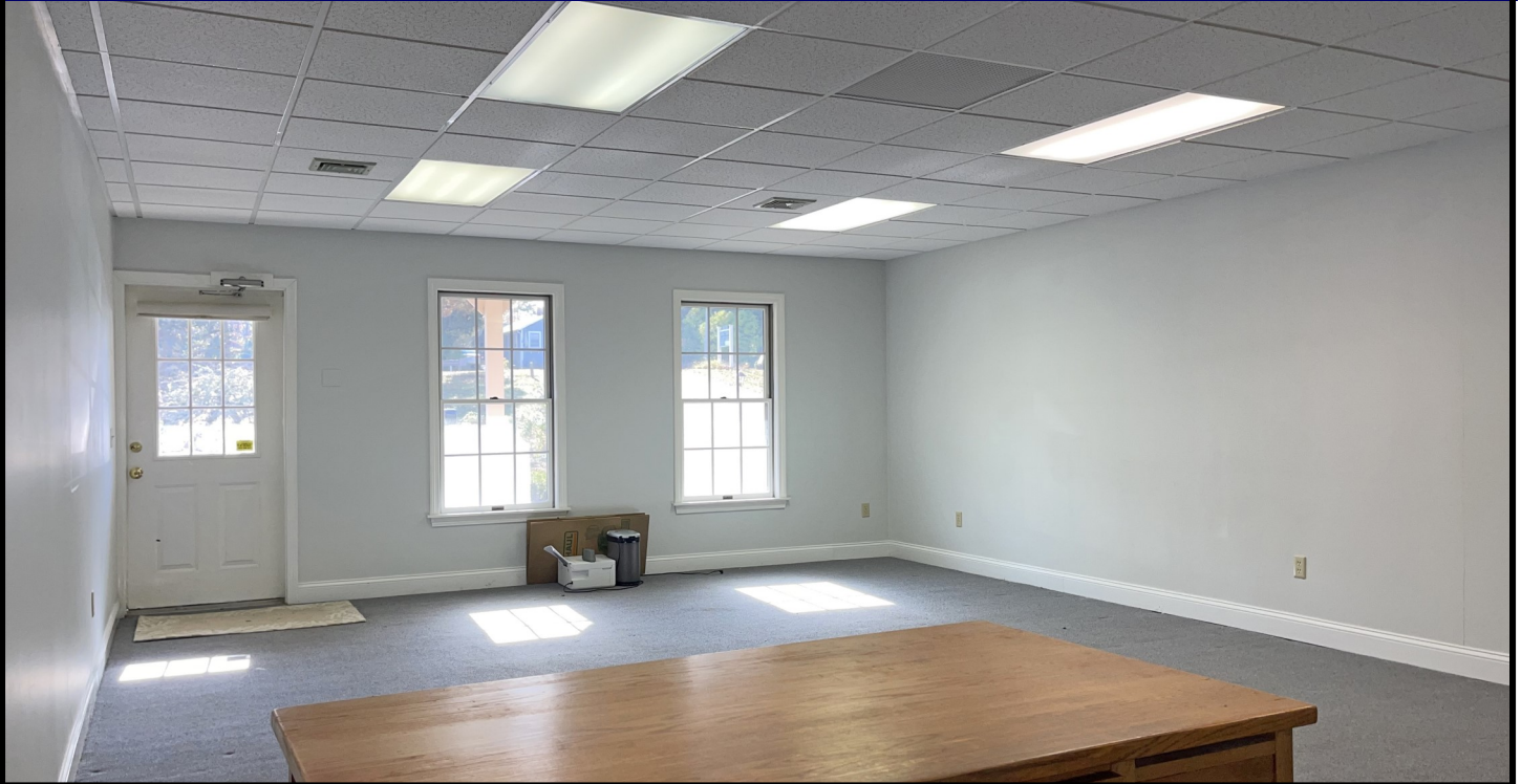
Above – Large Open Room - 30' by 19'