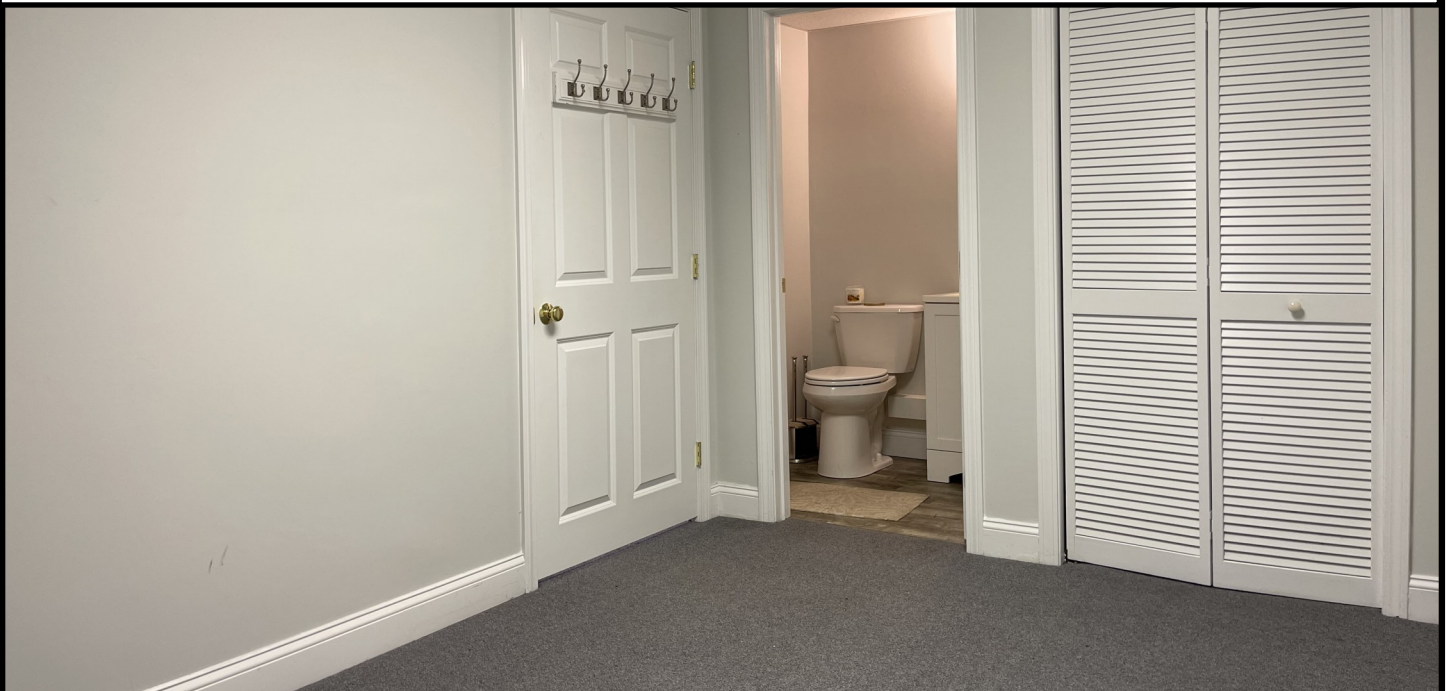
Above - Small Private Room and Restroom